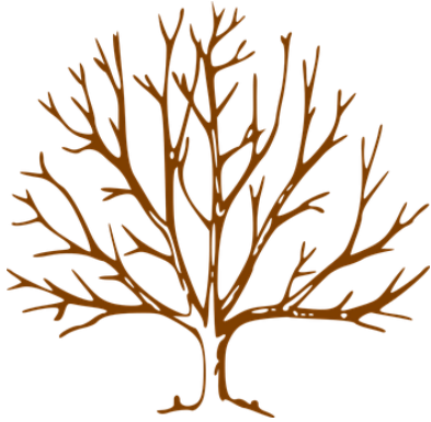
A In Spring...