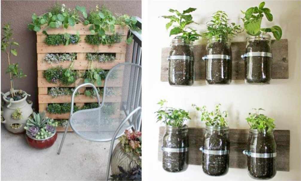
Figure 1: CC licence