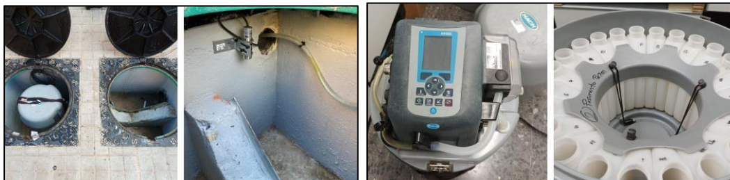
Figure 3: Water collecting chamber with flow measurement